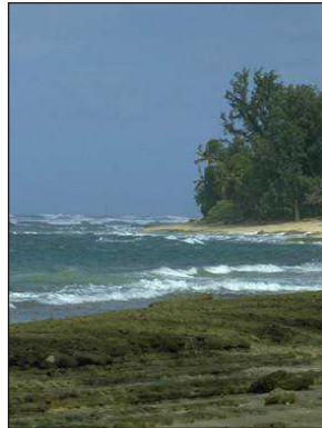
Jonah was thrown out onto dryland by the great fish.

The book of Joel has three chapters. Joel's name means "Jehovah is God" - what a wonderful name! Joel wrote his book of prophecy in Judah before Israel went into captivity. Because they were falling away from God, Joel warned the people about the coming judgment of God. But he also told them that if they would repent and turn back to God, that God would forgive them and they would receive His love and grace. Joel prophesied about the pouring out of the Holy Spirit on the believers on the day of Pentecost, which was the beginning of the church.