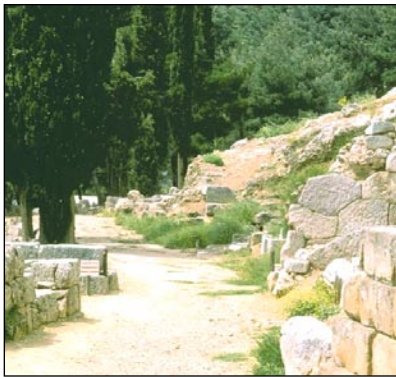
Saul received an unexpected visit from Jesus on the road to Damascus.

Saul was astonished. He knew that the One who had spoken to him was “the Lord”, but still did not know “who” it was. He said