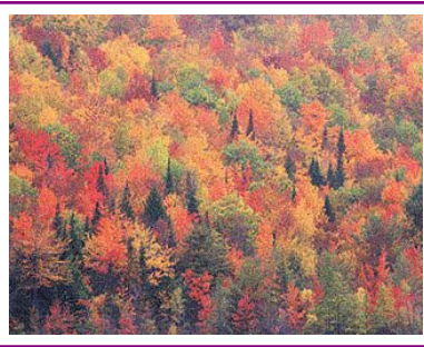
The earth is the Lord's.

of God exists and is growing in the church today. Because the Lord's blessing is upon the church, we are His expression today. When we live our lives in a proper way, we can express God. When we obey our parents and do the things that we ought to do, we also express God. This is why we need to learn the proper way to live and learn how to pray to God to help us to live that way. We learn these things in the church. The church is a wonderful place.