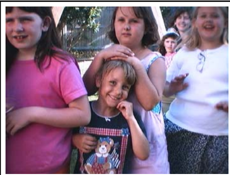
The church makes God and man happy.

The church makes God very happy. Being in the church also makes man very happy. The church is our real home, the place where we can be with the other saints and enjoy God together with them.