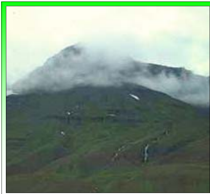
God gave the Ten Commandments to Israel at Mount Sinai.

Every law is made by someone, and every law reveals what kind of person it is that made the