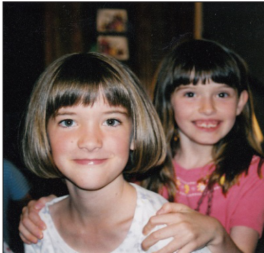
God’s interests on the earth are cared for by the church.

Often among the members of the church, there are saints or families that may have needs. They might need food, or clothing or other practical things to care for their lives. God encourages us to care for one another. He wants us to care for others and know that one day others might need to care for us.