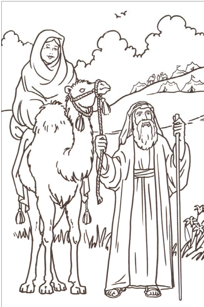
Abraham and Sarah patiently waited the fulfillment of God's promise to them; the birth of their son Isaac.