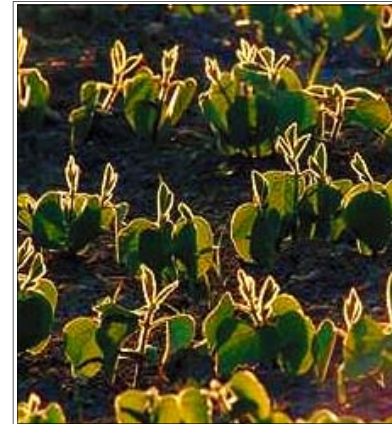
The farmer who planted these soybean seedlings will have to patiently for them to grow and bear fruit.

A patient person is not anxious while he waits for the things he desires. Neither is he idle or lazy. A patient person is diligently doing today what can be done today, and calmly waiting for what will come later.