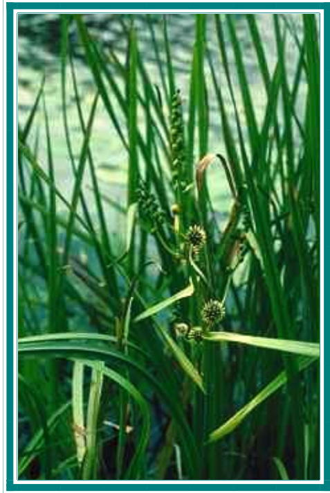
Plants With Seeds

God created all kinds of different plants. From the small grasses to the largest of trees. Each kind of plant had the ability to produce seeds. The seeds are for the producing of more plants of the same kind. God desired that the plant life would serve man. The plants would be for man's food and for man's enjoyment. Many of the things we eat come from the plant life.