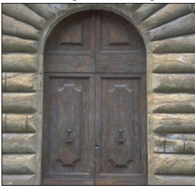
Paul and Silas were put inside an inner prison in stocks.

At midnight Paul and Silas were praying and began to sing praises to God. All the other prisoners were listening to them. Suddenly, a great earthquake shook the foundations of the prison. Every door in the prison was opened and every prisoner's chains were