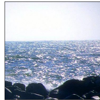
Paul received a vision of a man calling him over into Macedonia.

When they arrived in Macedonia, they came to a leading city named Philippi. There they met a woman named Lydia. Paul shared the gospel with her and the Lord opened her heart to receive the Word. Because of the gospel, Paul and Silas were put into prison. But God caused an earthquake to break the prison open and to open the heart of the jailer. The jailer was saved and baptized. This was the beginning of the church in the city of Philippi.