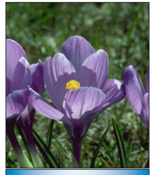
The Lord Jesus has the power to conquer not only sickness, but also death.

Jesus, indeed could have come earlier. But Jesus knew what He was doing. He actually waited until Lazarus had died before He came. He did this to show