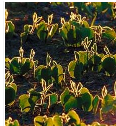
The farmer who planted these soybean seedlings will have to patiently for them to grow and bear fruit.

A patient person is not anxious while he waits for the things he desires. Neither is he idle or lazy. A patient person is diligently doing today what can be done today, and calmly waiting for what will come later.