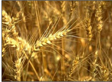
Boaz was pure in his heart toward God. Because of this God blessed him.

Now Boaz had heard of the wonderful things that Ruth had done for her mother-in-law, Naomi, after Ruth's husband had died. He heard that she wouldn't leave her mother-in-law, but stayed with her even when she came to Israel, a land where Ruth had never been before.