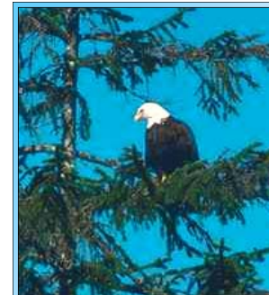
The eagle has a very broad view from up high.

W e need a broad heart that has a wide perspective. We need a heart that is how God's heart is: broad, concerned for all people, regardless of how they are, their race, class, grade or age. We should not respect some people and despise others. If the rich person "mocks the poor" he "reproaches his Maker" (Prov. 17:5). His heart is too narrow; he only appreciates those who are like himself.