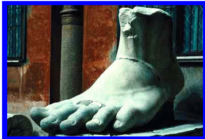
It is foolish to think that any kind of man-made image could see, or hear or answer prayer. But the nations that did not know God thought it was true.

The nations would make images to represent these gods. They would bow down and worship them. They would pray to them, hoping that the “gods” would do good to them.