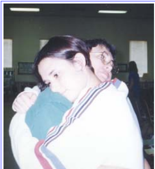
God gives our parents the wisdom to know how to guide us.

God chose our parents and determined that we would be born into our particular family (Psa 139:13). God has entrusted our parents with our care, guidance and discipline. Many times they pray to God for us; to ask for wisdom to know how to guide us and deal with us. God helps them and gives them wisdom and understanding. (James 1:5). Often however, our parents have a difficult time in guiding us because of our disobedience.