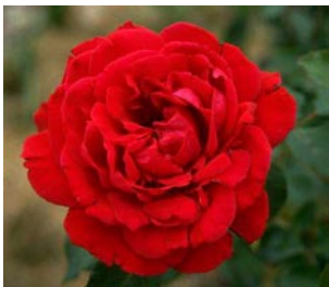
The New Testament

The New Testament begins with four books called “gospels”. The names of the gospels are “The Gospel of Matthew”, “The Gospel of Mark”, “The Gospel of Luke” and “The Gospel of John”. Many times these books are simply referred to by using the writer’s name, such as “the books of Matthew, Mark, Luke and John.”