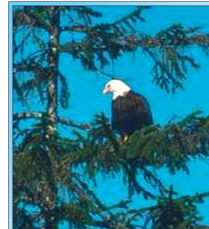
The eagle has a very broad view from up high.

W e need a broad heart that has a wide perspective. We need a heart that is how God's heart is: broad, concerned for all people, regardless of how they are, their race, class, grade or age. We should not respect some people and despise others. If the rich person "mocks the poor" he "reproaches his Maker" (Prov. 17:5). His heart is too narrow; he only appreciates those who are like himself.