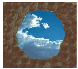
This is how much sky a frog can see when he looks up from inside a well. Can he see as much as the eagle?

We need a wide perspective that we can see the complete scenery, the whole situation around us. Then we can have largeness of heart like King Solomon had. He built the greatest temple for the Lord that has ever been built upon the earth.