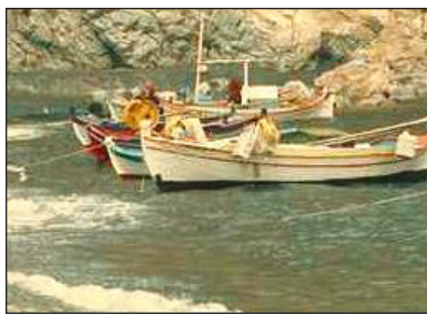
Jesus appeared to the disciples when they were fishing.

One apostle was missing that night – Thomas. When the other ten apostles told him that they had seen the Lord, he would not believe them. He said “Unless I see in His hands the mark of the nails and put my finger into the mark of the nails and put my hand into His side, I will by no means believe.” Eight days later, when they were gathered together again, Thomas was with them. Jesus appeared to them again in the room, and had a special talk with Thomas. He said “Bring your finger here and see My hands, and bring your hand and put it into My side, and be not unbelieving, but believing.”