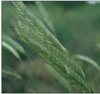
The serving ones assisted with the fair distribution of food.

As the new church was growing in Jerusalem there were many different kinds of people. There were young and old, rich and poor. There were many who had needs and there were others who joyfully gave what they had to supply those needs.