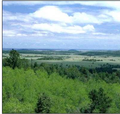
Barnabas and Saul were sent out to bring the gospel to the Gentiles.

God opened the door of the gospel to the Gentiles through Peter at the house of Cornelius. But nearly all of the disciples were Jews and still spoke only to the Jews. Some did, however, speak to the Gentiles at a city called Antioch and many Gentiles believed and turned to the Lord.