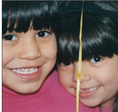
Giving back to God fills us with joy and makes God very happy.

In the Bible we are told that all of God's people should give something back to God out of all the things that they have received from Him. God does not ask us to give what we do not have. But rather He asks us to give a small part from all that He has first given to us.